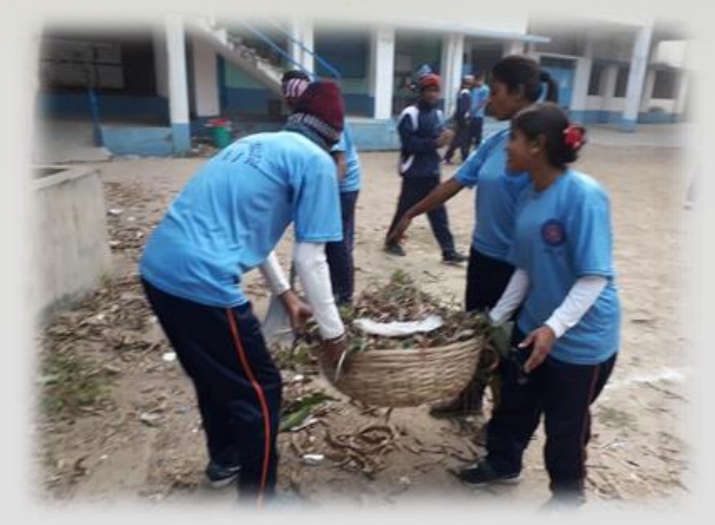
ANNUAL CAMP, 2019