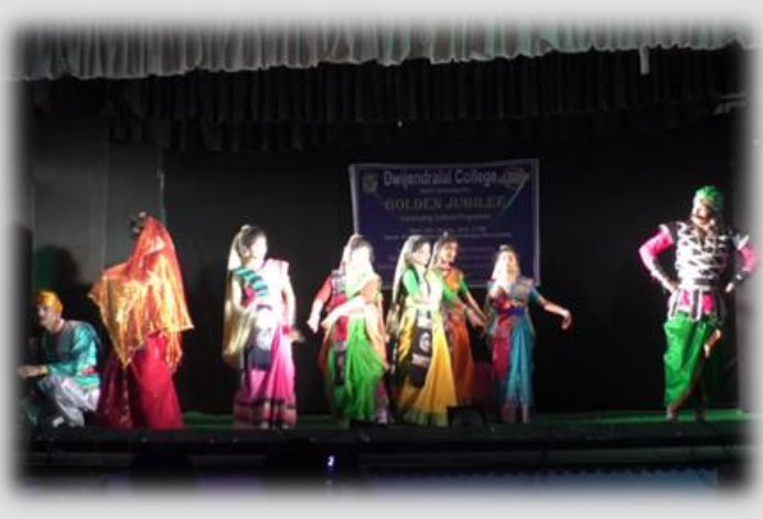
TEGORE'S DANCE DRAMA SHYAMA, JANUARY, 2019