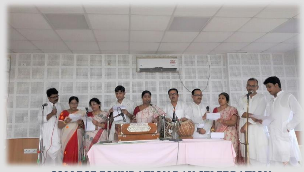
COLLEGE FOUNDATION DAY CELEBRATION