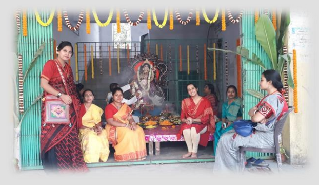
SARASWATI PUJA, 2020