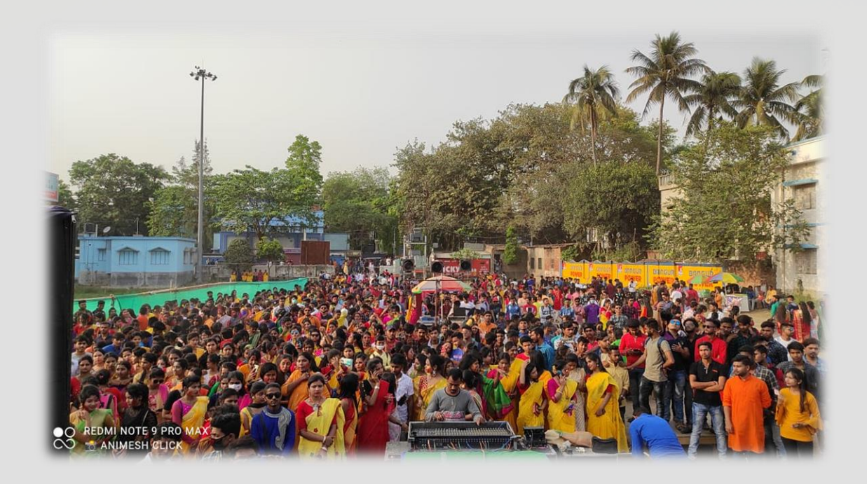
COLLEGE SOCIAL, 2018

Events like college social and fresher's welcome are organized by the students are always encouraged by the teachers so that they can develop their talent, team spirit and leadership skill.