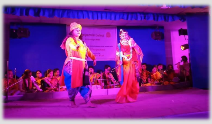
TEGORE'S DANCE DRAMA CHITRANGADA, DECEMBER 2017