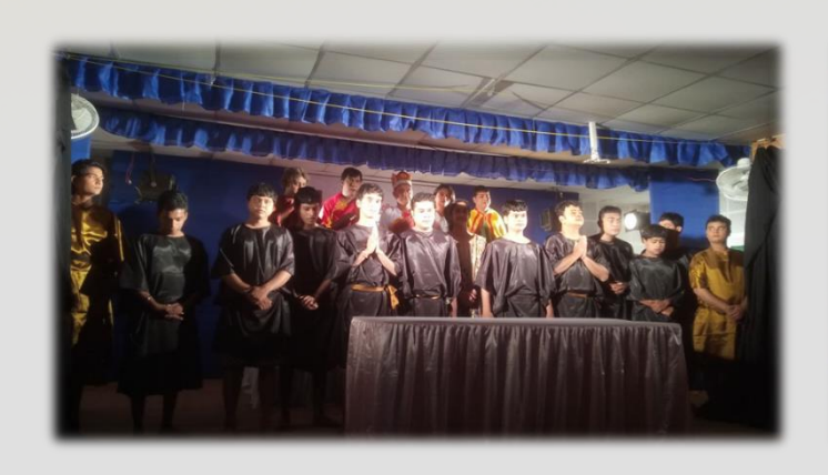
SHAKHESPEARE'S DRAMA JULIUS CAESAR, DECEMBER 2017